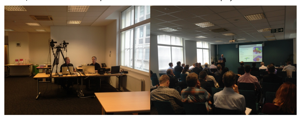
Figure 1 Webcast and seminar in London

Where time allowed, questions were taken following each presentation. At the end of the meeting in London, time was allocated for a panel session to enable discussion on the project as a whole.